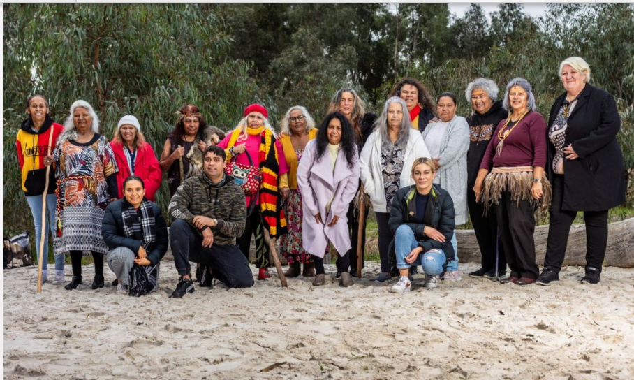
Dja Dja Wurrung Elders with DJAARA Membership Team staff and Members

NAIDOC week was a special time to honour and celebrate our Dja Dja Wurrung Elders. The Member Engagement team took the opportunity to show our appreciation, with four days of activities and a little bit of spoiling!